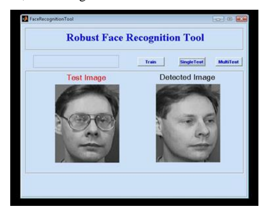
Figure 1. Test image and Detected image

Facial acknowledgment security framework is broadly utilized in light of its significant advantages. For example, it should be possible from a more remote separation without letting the individual mindful that he/she is being checked. Such productive frameworks are required in banks, ATM or government workplaces as illustration, and this improves facial acknowledgment frameworks than other biometric advancements in that they can be utilized for observation purposes for eg. looking for offenders, suspected fear based oppressors, or missing individuals.